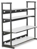
60" PERFORMANCE PLUS WORKBENCH