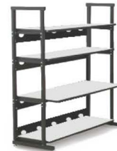
48" PERFORMANCE PLUS WORKBENCH