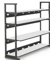
72" PERFORMANCE PLUS WORKBENCH