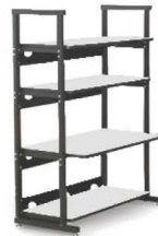
36" PERFORMANCE PLUS WORKBENCH

Pre-configured Performance Plus Lan Stations includes three 24" deep shelves, one 30" deep shelf, two side frame kits, four shelf support kits, and four back plates.