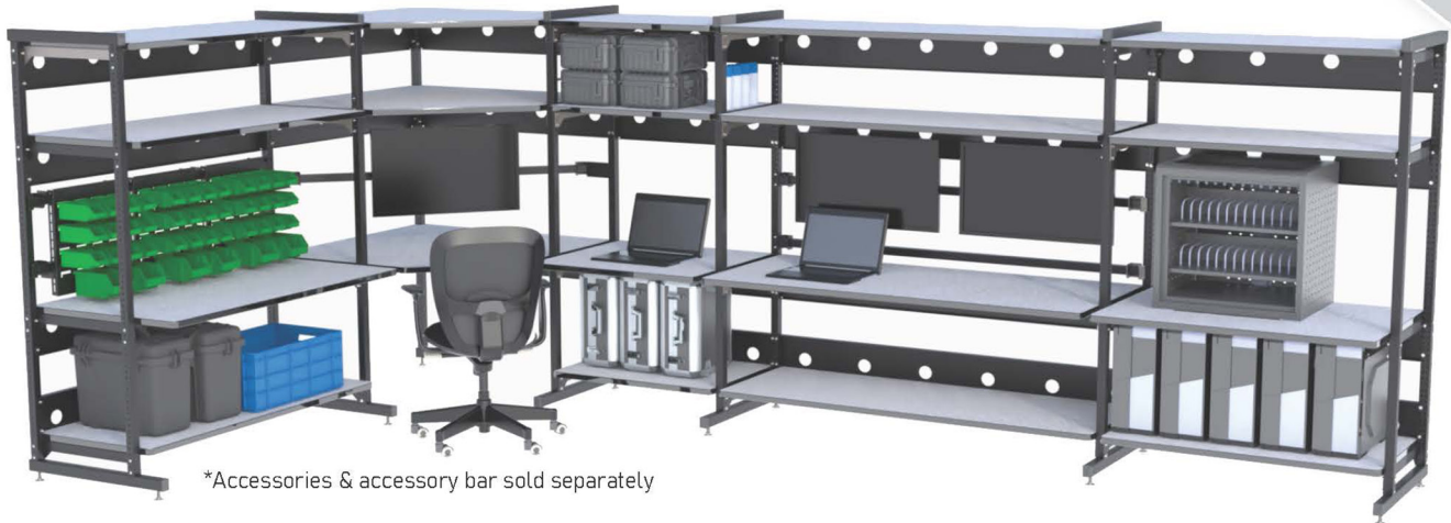
*Accessories & accessory bar sold separately

Strength and durability in a modular solution that adapts to your needs