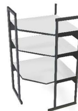
PERFORMANCE PLUS CORNER WORKBENCH