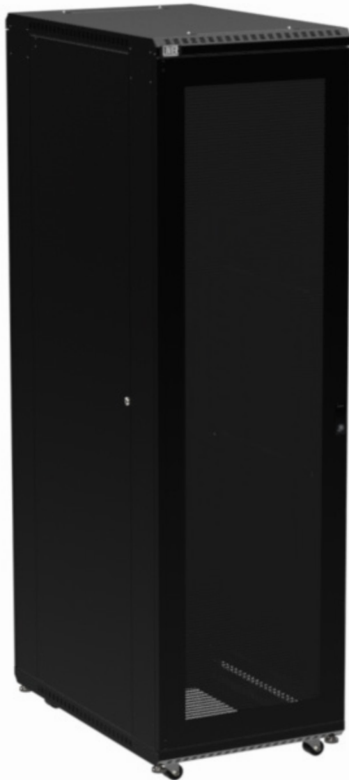
45U LINIER® VENTED/VENTED 36" DEPTH Item #3107-3-001-45

An American made enclosures with features to make your installs worry free