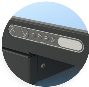
HEIGHT CONTROL PANEL