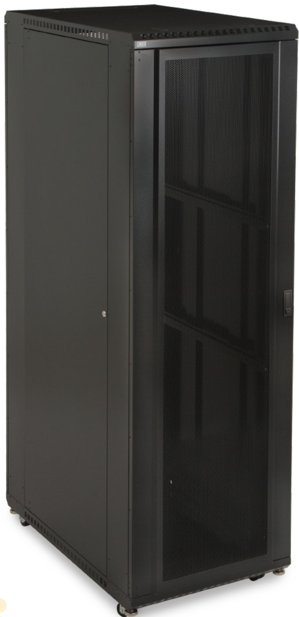
Convex Door/Vented Door 3110-3-001-42