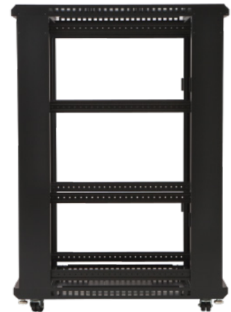
Side view with no side panels 3170-3-001-27

The LINIER® 36" deep cabinets are suitable for network servers, battery backups, switching banks, and other larger pieces of equipment.